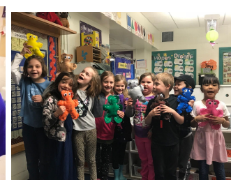
Teddy Bear Picnic